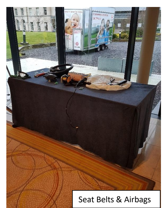
Seat Belts & Airbags