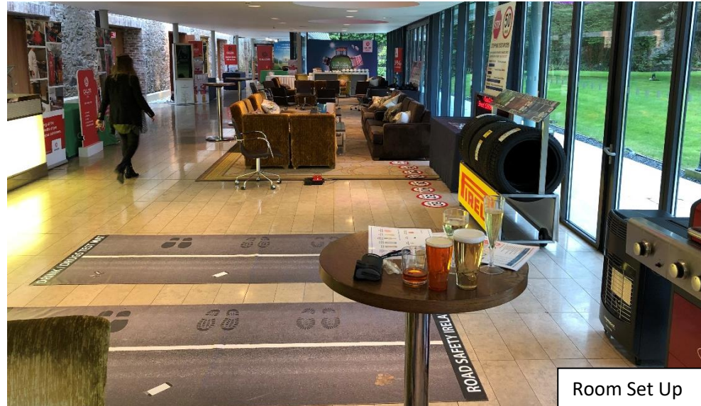
Room Set Up