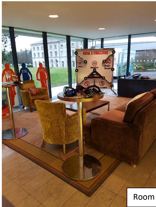
Room Set Up

Road Safety Ireland attended the Farnham Estate Golf Resort & Spa for Calor Gas Road Safety Experience . Below are images of the layout and Calor Gas employees taking part in the Road Safety activities.