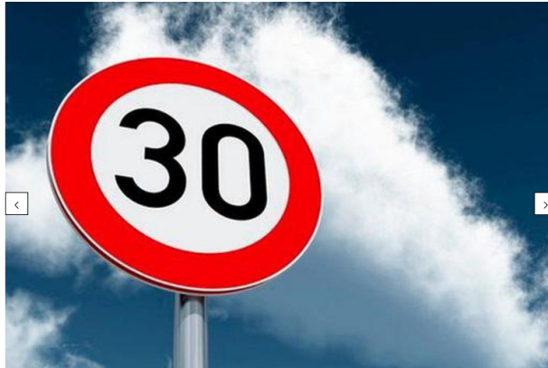
The 30k speed limit outside schools starts on August 1.

Speed laws adopted on Monday to come into force in August