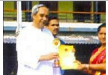
Best Road Safety Activist Award-09