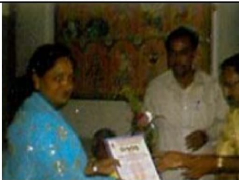
Best Social Activist Award-2009