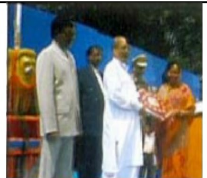
District Level Road Safety Award-2008