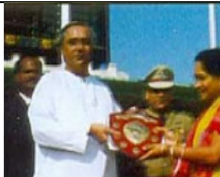
Best Organisation Award For Environmental Awareness -2006