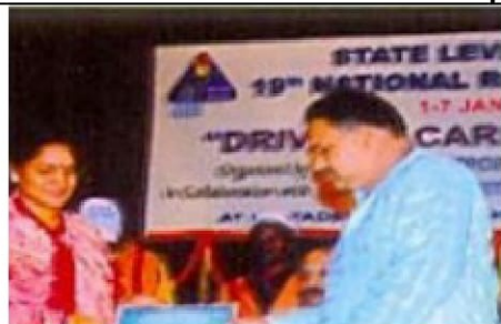
Road Safety Appreciation- 2008