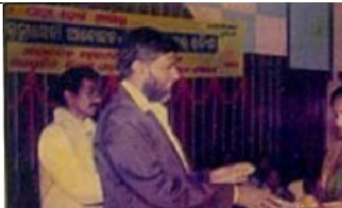
Naba Krushna Sammana-2001