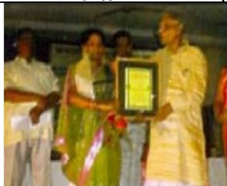
Naya jyo ti Award- 2008