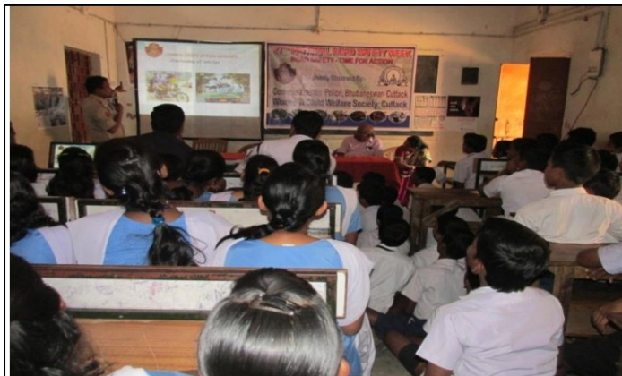
(Nehrupalli High School, dt. 18.01.16)