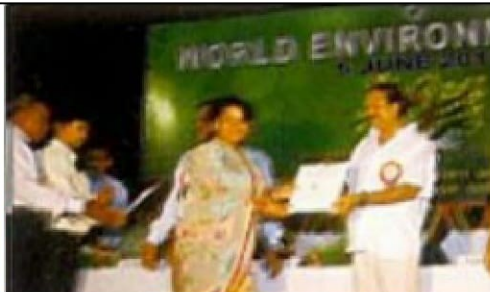
Prakruti Mitra Puraskar-2011