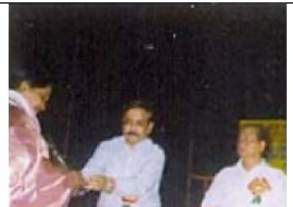
Rajiv Gandhi Sadvabana Award-2007