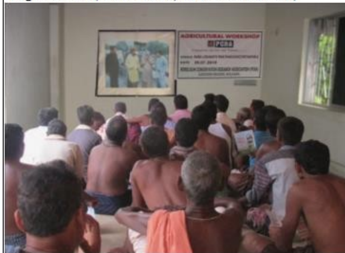
A view of Petroleum Products Conservation Film Show in PCRA-Agricultural Workshop