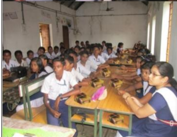
A view of student participants of the Panchayat High School, Machhalo, District: Cuttack,