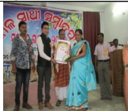
Best Social Activist Award-2016