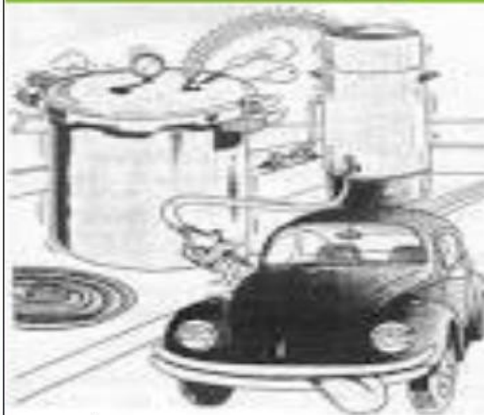
A view of Painting Image on PCRA- "Sakham" National Painting Competition-2016 draw by school students.