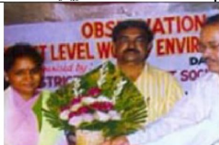
Prakruti Bandhu Award-2007