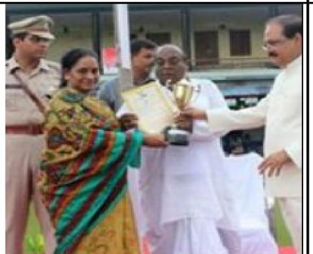
Best Road Safety Activist Award-2016