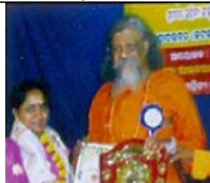
Seba Ratna Samman-2009