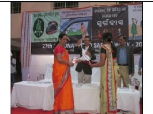
Best Road Safety Activist Award-2016