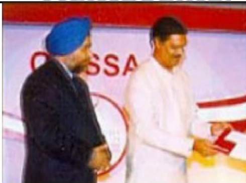
14 th Godphery Philips Bravery Award 2006